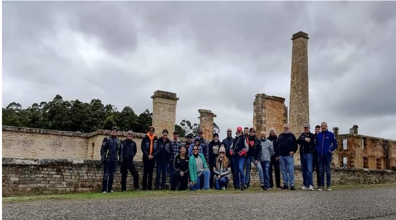
Port Arthur - Tasmania