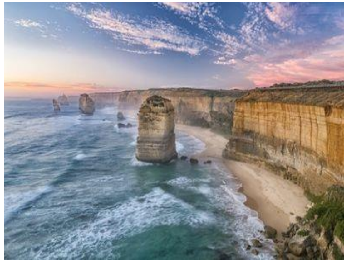
12 Apostles – Great Ocean Road