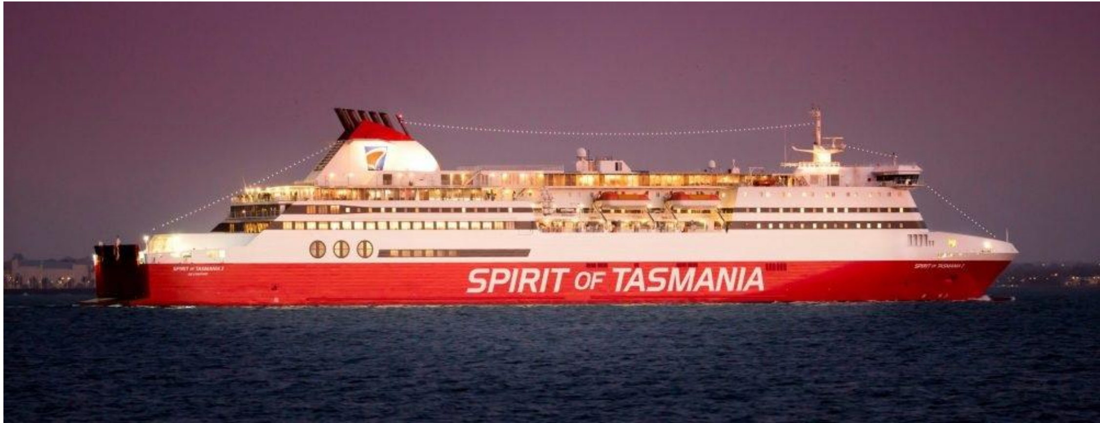
Spirit of Tasmania